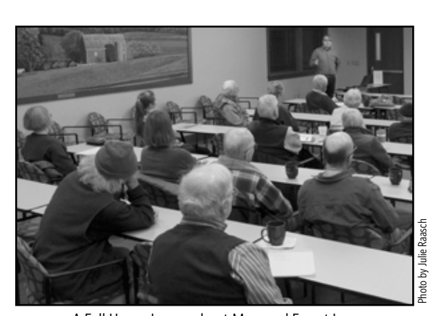
A Full House Learns about Managed Forest Law