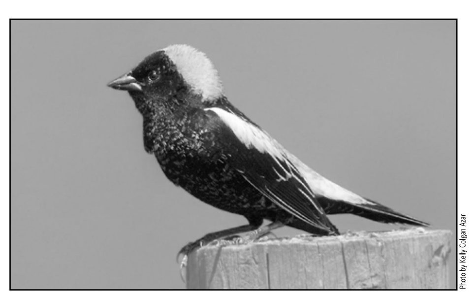
Male bobolink ( Dolichonyx oryzivorus )

The bobolink has a relatively widespread distribution in North America and once enjoyed robust populations. However, bobolink numbers have taken a nosedive. In Wisconsin, bobolink populations have plummeted nearly 80% since the 1960s. Why? Every spring, beginning in late April, bobolinks arrive here after spending half the year in South America. There, swarms of hundreds of thousands of birds may gather in agricultural