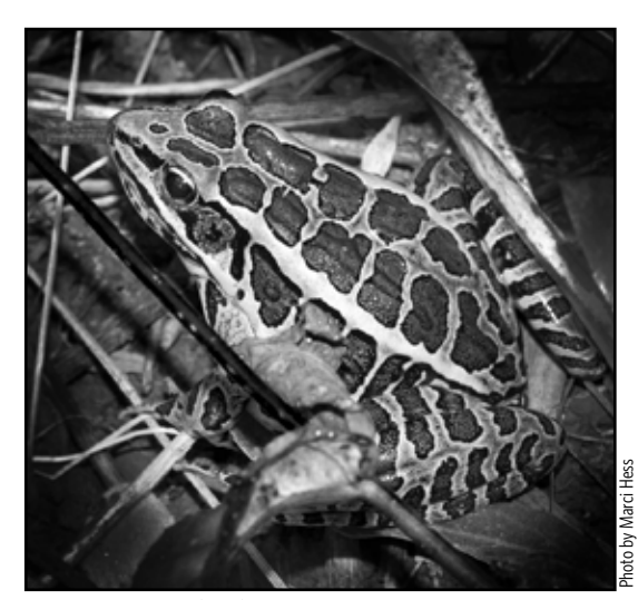
Pickerel Frog in a Mesic Prairie

Conduct prescribed burns during winter, when herpetofauna are inactive. This period is from November 1 to March 15 generally, but varies based on fluctuations in annual precipitation and temperature conditions. When soil surface temperatures exceed deeper soil temperatures, it indicates the onset of activity for many species. But because some salamander species and Blanding's turtles emerge from