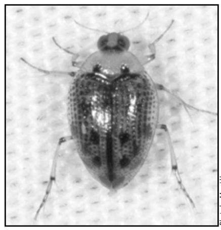
Peltodytes edentulus : Haliplidae (crawling water beetle) would have a tolerance score of 7

Now that you know WHY aquatic insects are great indicators of water quality, you may be wondering what they look like and how you can identify them. There is a great reference published by Purdue Extension (http://www.ydae.purdue.edu/natural_resources/Resources/BioindicatorWQ/Pubs,PDF/BioInd,WQ,4-H-1019.pdf) that provides detailed instructions for using bioindicators to determine