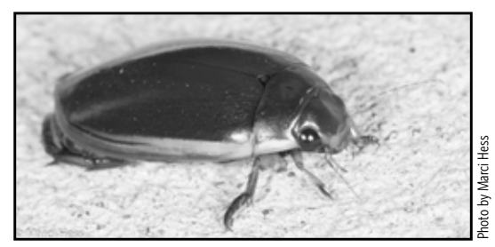
Cybister fimbriolatus : Dytiscidae (predaceous diving beetle) would have a tolerance score of 5

How can an insect like a dragonfly, which lives in the air, help us determine the quality of the water? Aquatic insect adults lay their eggs in the water. The eggs hatch and the immature form lives in the water, sometimes for years, before transforming into winged adults. The composition of the aquatic insects population (aka bioindicators) is used to ascertain water quality and reveal pollution impact. Much like plants are assigned conservation numbers, aquatic insects have a numeric designation, too. This designation is called a Tolerance score and