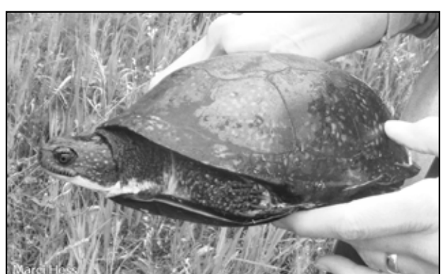
Blanding's Turtle with the Distinct Yellow under the Chin

It's important to leave cover for amphibians and reptiles, even those that are typically thought of as "prairie" specialists. For example, juvenile ornate box turtles that were radio-tracked for a season were found to heavily use patches of sumac and black locust rather than be exposed to the greater temperatures and lesser humidity in more open and sunny areas of the prairie.