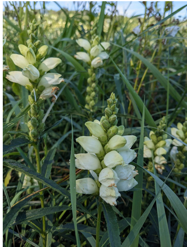
White Turtlehead - Chelone glabra

As we begin thinking about the growing season, I'm officially opening up BMAP's Site Visit Questionnaire for folks interested in a 2025 Site Visit. Depending on the level of interest, openings for site visits may be limited. If you are interested, expect to hear from me directly about planning a specific date/time for a site visit in mid-March.